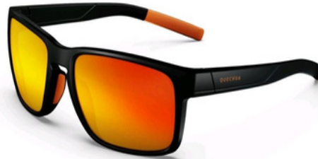
Cat 3 Sunglasses