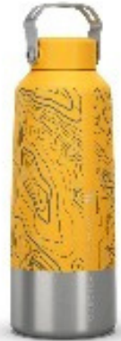
Thermal Water Bottle