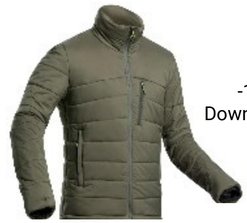
-10° Down Jacket