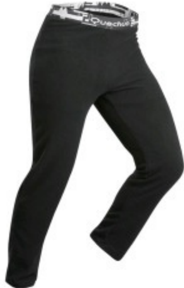
Fleece Inner Lower