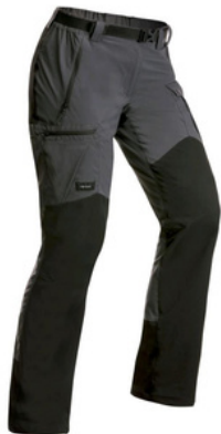
Water Repellent Pants

Rs. 300 to 500 (4D/3N) According To Quality