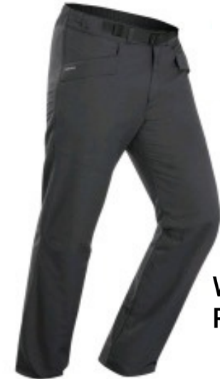
Warm Water Repellent Pants