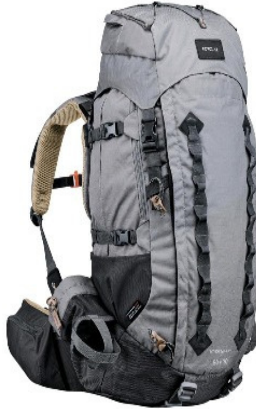
50+10 Liters Backpack