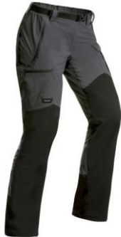
Water Repellent Pants