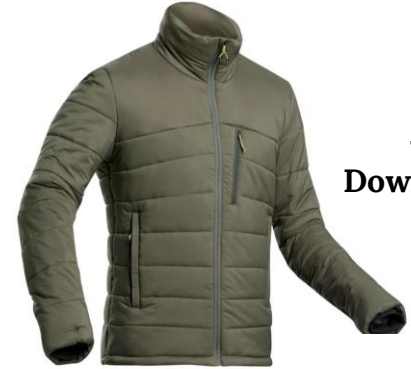
-5 ° Down Jacket