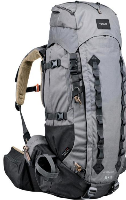
50+10 Liters Backpack With Waterproof cover