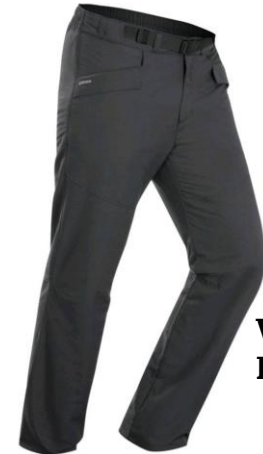
Warm Water Repellent Pants