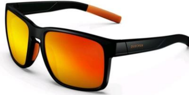
Cat 3 Sunglasses