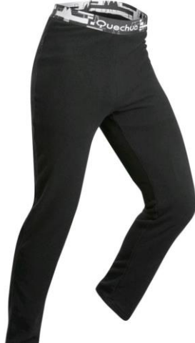
Fleece Inr Lower